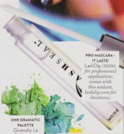
PRO MASCARA—IT LASTS! LashDip ($200, for professional application; comes with this sealant, lashdip.com for locations)

Need help with a big beauty dilemma? E-mail andrew@glamour.com.